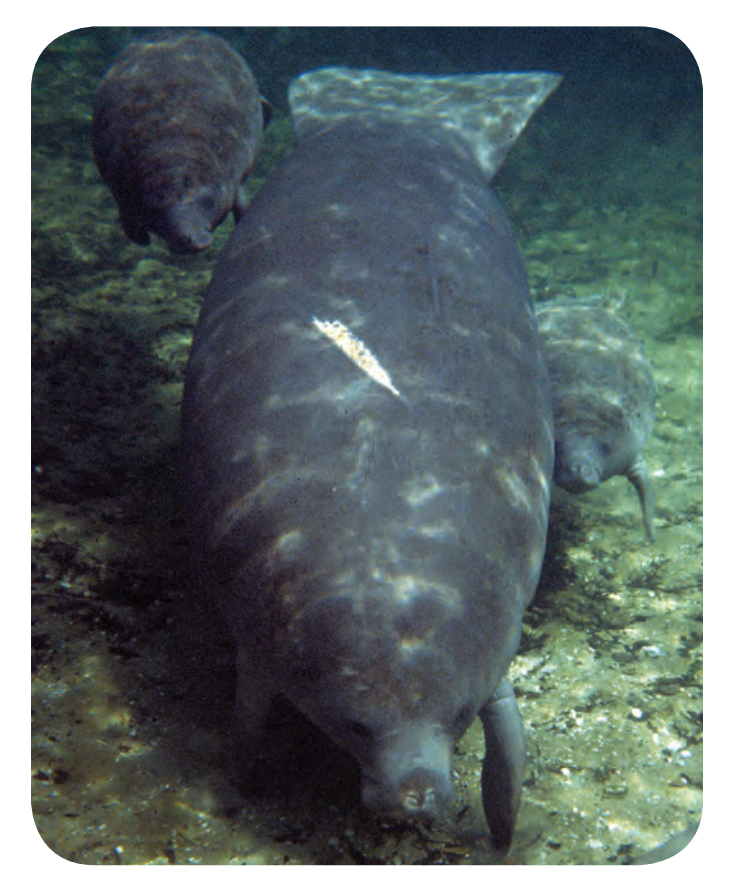
Figure 1. Calculating manatee ( Trichechus manatus latirostris ) survival rates is based on monitoring uniquely marked individuals. Contact with a boat propeller injured this manatee. The healed scar is one of the "naturally occurring" marks used to identify this individual. Annual resightings of uniquely scarred manatees provide the data to estimate annual survival rates. Photographs are used to document the sightings and to verify identifications of individuals in the scar-catalog database. This female, BS107, has been photographed regularly since 1988 and gave birth to twins in 1991.

In 2004, four major hurricanes impacted three of the four manatee subpopulations in Florida, and in 2005, three major hurricanes struck again (fig. 2). These storms have provided us with a series of natural experiments to further study hurricane effects on manatees. The primary objectives of our research are to gather data before, during, and after hurricane strikes and to use the information to (1) assess the magnitude of